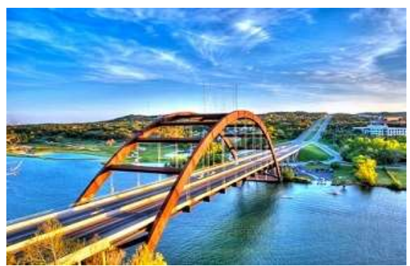
The Pennybacker Bridge in Austin is a througharch bridge across Lake Austin which connects the northern and southern sections of the Loop 360 highway, also known as the "Capital of Texas Highway."