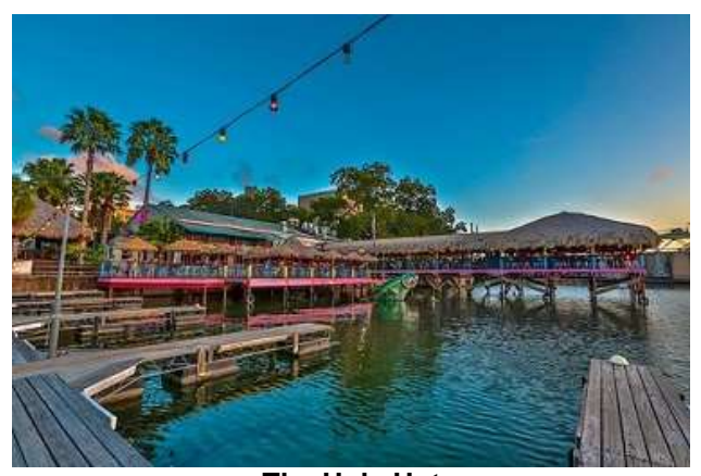
The Hula Hut

And finally, if you are from Hawaii, Austin has just the place for you. Aloha, Y' ALL! It is called the Hula Hut and overlooks beautiful Lake Austin.