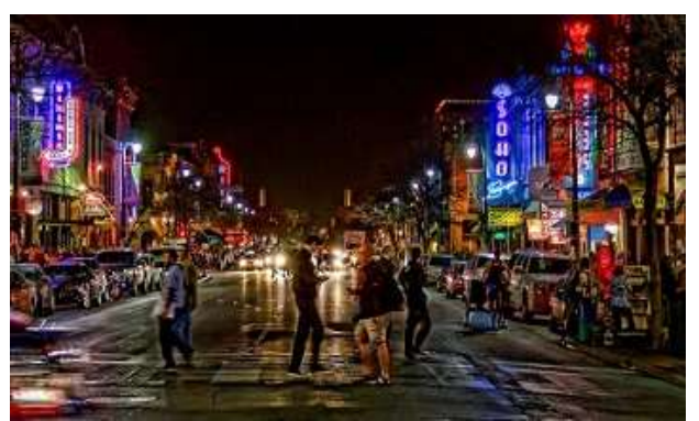
Austin Bar Area on Sixth Street

(WHY CAN'T THE CITY OF HONOLULU DO SOMETHING LIKE THIS? I WILL TELL YOU WHY – WE HAVE LITERAL GUTLESS GOVERNMENT OFFICIALS WHO ARE AFRAID TO DO ANYTHING.)