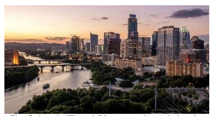
The Colorado (Texas) River runs through Austin