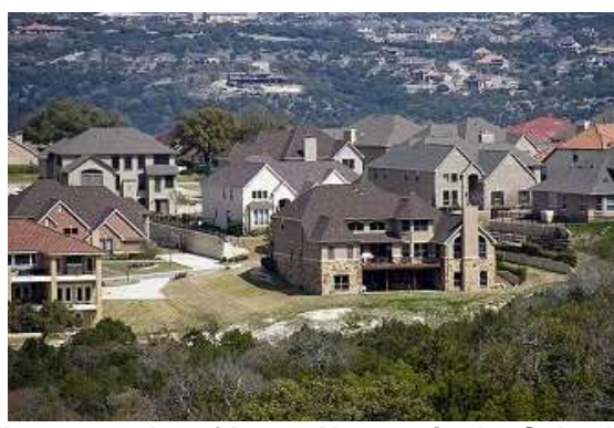
There are a lot of Large Houses in the Suburbs