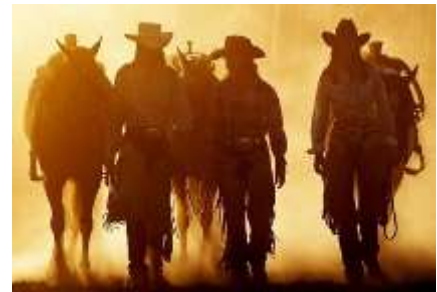
Austin Cowboys, Rodeo, and Cowgirls (Plus several Longhorn Cattle Herds)