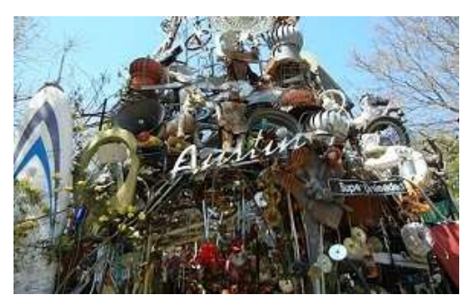
Cathedral of Junk

Hundreds of people visit a big pile of junk every day. Yes, the Cathedral of Junk stands quietly in the backyard of a small house on a suburban street on the south side of Austin. Unlike other busybody constructions that we've visited, this one blends with its neighborhood. From the street, it's invisible.