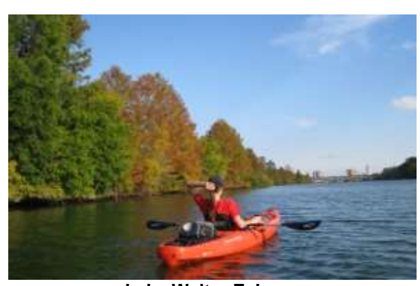
Lake Walter E. Long