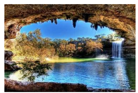
Hamilton Pool is a historic swimming hole located 3/4 mile upstream from its confluence with the Pedernales River. Hamilton Creek spills out over limestone outcroppings to create a 50-foot waterfall as it plunges into the head of a steep box canyon.