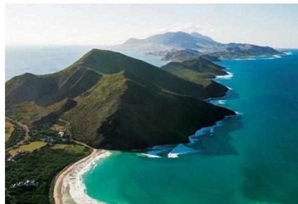
The Island of St. Kitts