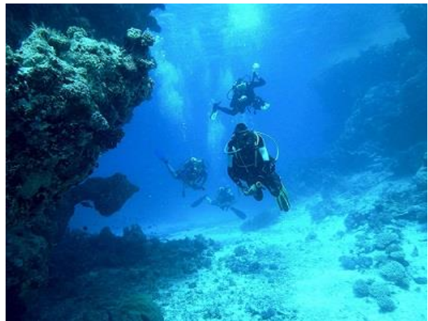
Eden Rock and Devil's Grotto