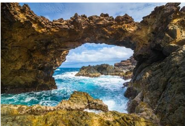
Aruba Natural Bridges