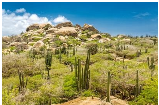
Arikok National Park