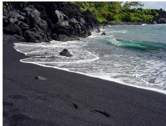
St. Vincent Black Sand Beaches

Due to the island's volcanic origin, most of St Vincent beaches are black sand with two notable exceptions at Villa and Indian Bay, where many hotels are located. For classic white sand beaches, choose the Grenadines such as Union Island, Canouan, Mustique, Bequia, and Palm Island.