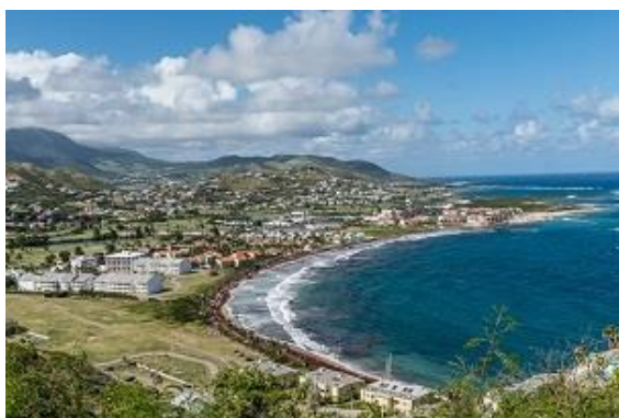
Capital City of Basseterre