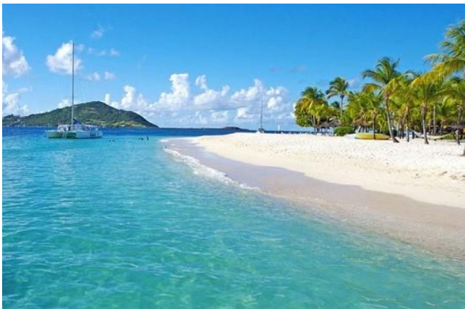
Palm Island in the Grenadines