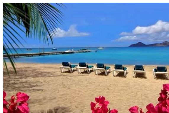
Qualie's Beach on the Island of Nevis