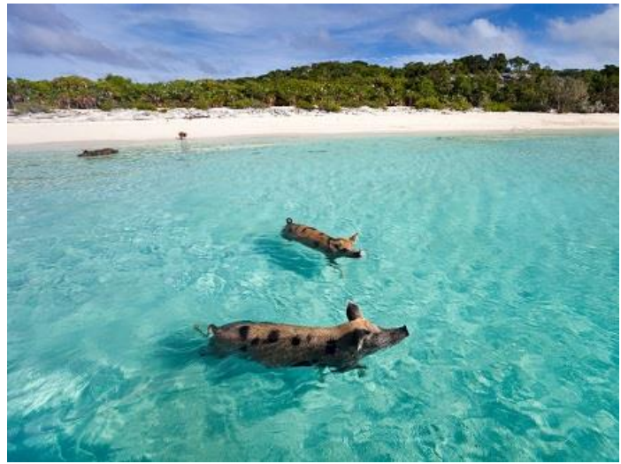
Swim with the Pigs