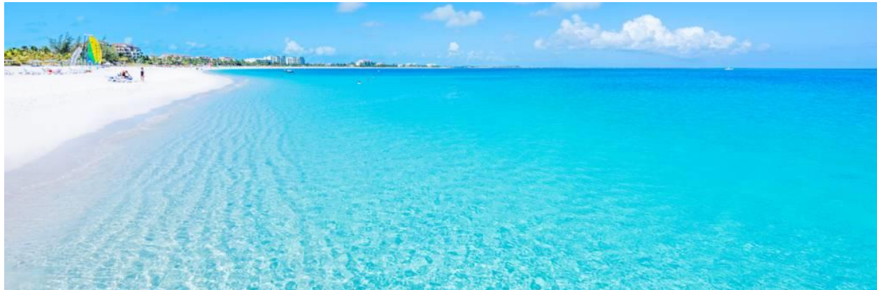
Grace Bay Beach

Located on Providenciales (known as Provo locally) - an island in the northwest Caicos Islands