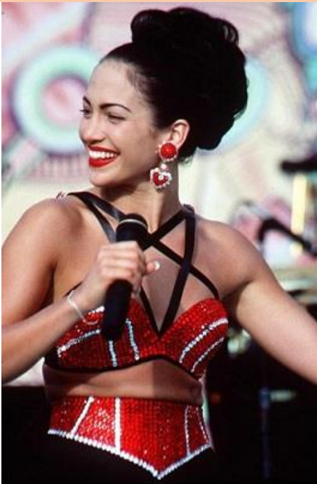
Jennifer Lopez in movie Selena

Lopez spent her entire academic career in Catholic schools, finishing at Preston High School in New York City.