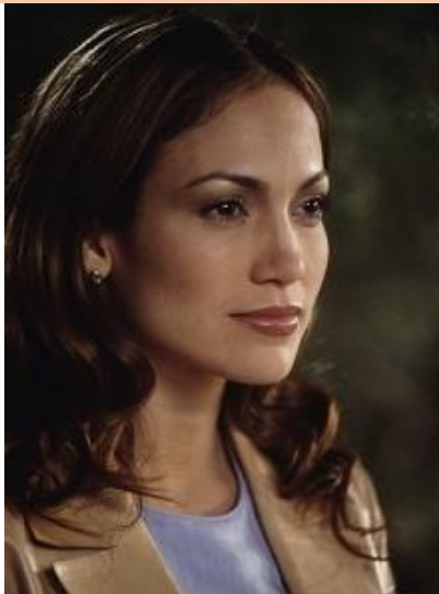
Lopez in movie "The Wedding Planner"

Celebrities are paid a lot for making appearances at various events around the globe. Jennifer Lopez was once paid $1 million just to attend a Ukrainian wedding.