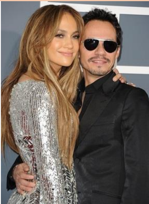
Jennifer Lopez and Marc Anthony

“Anaconda” is a 1997 adventure-horror film, directed by the Peruvian Luis Llosa, starring Jennifer Lopez, Ice Cube, Jon Voight, and Eric Stoltz. It centers on a documentary film crew who have been taken hostage by a snake hunter who is going after the legendary giant anaconda, which is discovered in the Amazon rainforest. Despite receiving mostly negative reviews from critics, the film was a box-office hit (It made $135 Million) and was followed by a series of sequels.