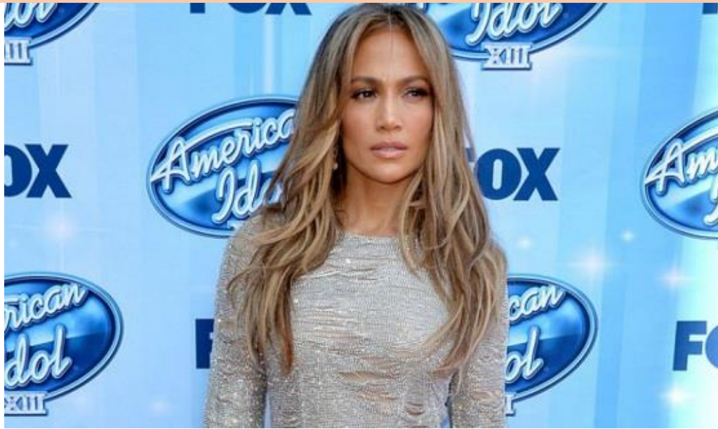
Lopez joins the judges on American Idol

In 2011 following the departure of Ellen DeGeneres from American Idol, it was officially announced in September that Lopez would be joining the tenth season of American Idol. MTV stated that the deal was "mutually beneficial to all those involved", while CNN reported that Lopez was viewing it as a decision to revive her career, while American Idol producers believed that Lopez would strengthen viewing figures. In October, Lopez released her fourteenth fragrance, Love and Glamour. The perfume was inspired by Lopez's forthcoming "return to the spotlight".