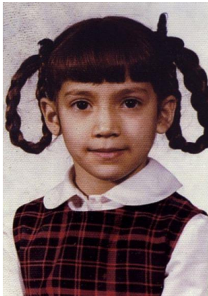
A young Jennifer