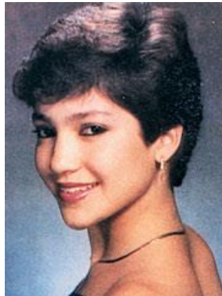
High School Picture