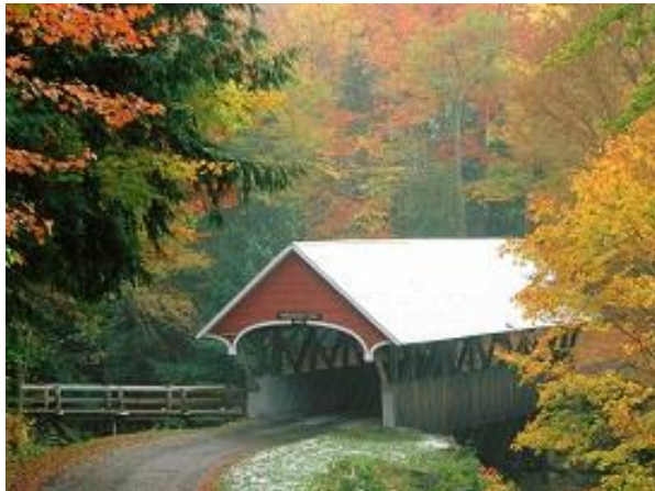
Famous Covered Bridges