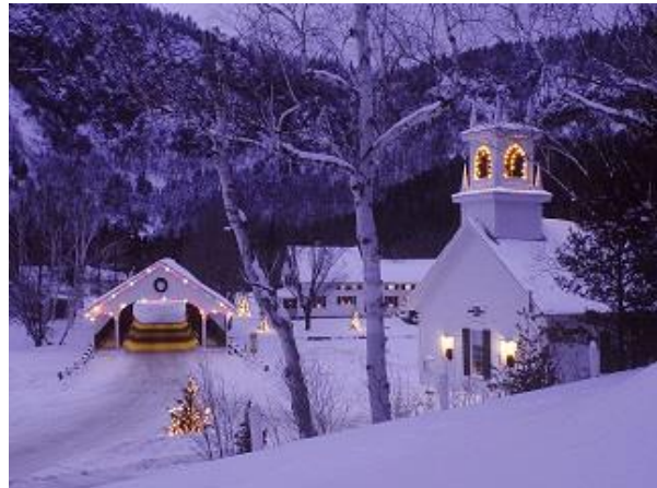
Quaint New Hampshire Village