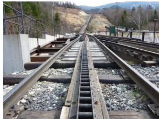
Mount Washington COG Railway