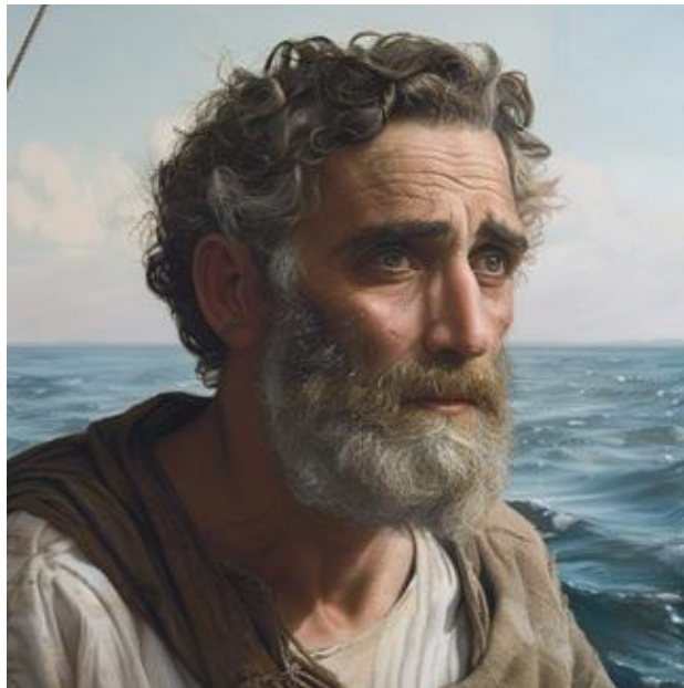
The Apostle Peter