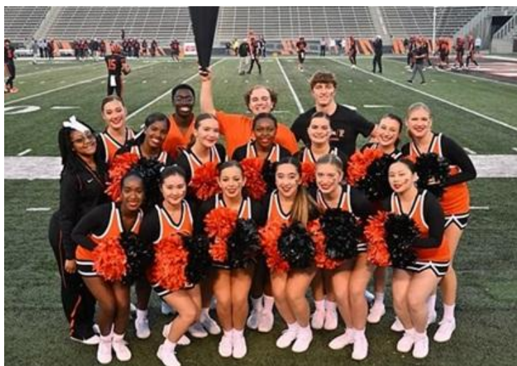
New Hampshire University of New Hampshire Durham