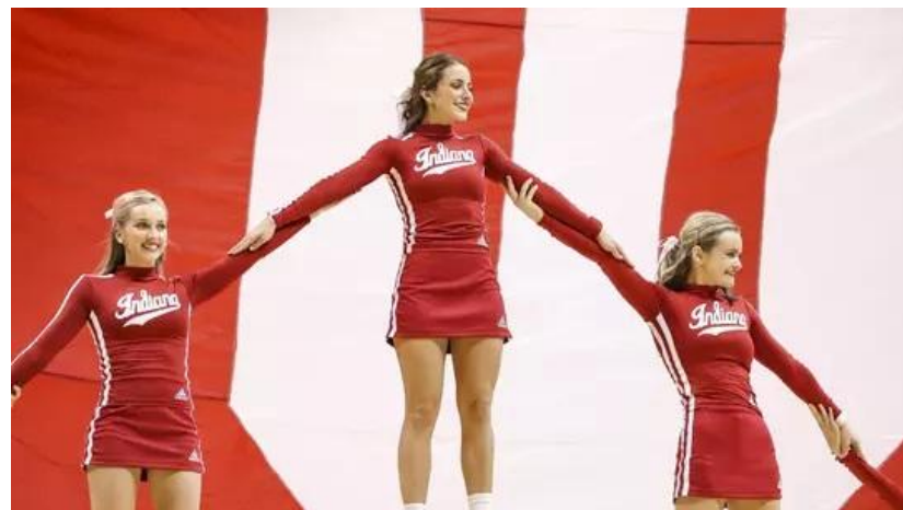
Indiana Indiana University Bloomington