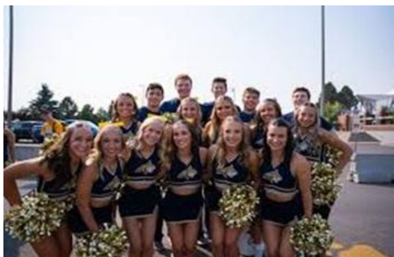
Montana Montana State University Bozeman