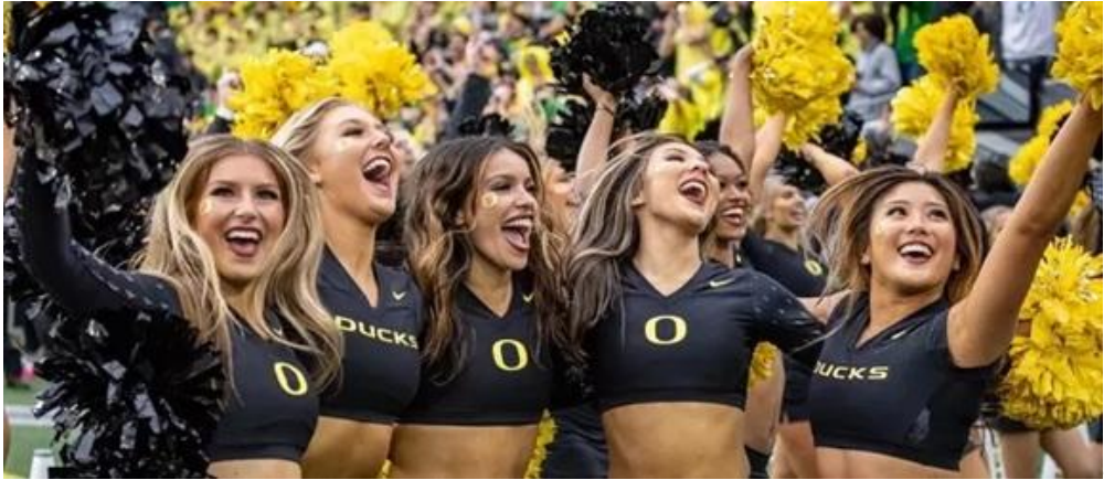
Oregon University of Oregon Eugene