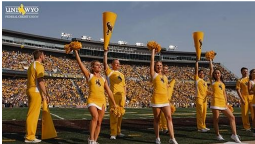
Wyoming University of Wyoming Laramie

Well, there you have it – cheerleaders from one university in each US state. However, I was not quite done – I went back and picked the universities with the most attractive cheerleaders in each region of the US.