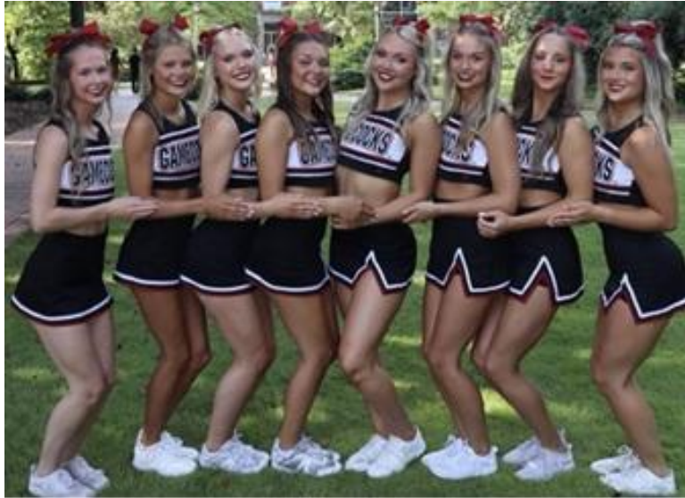
South Carolina University of South Carolina Columbia