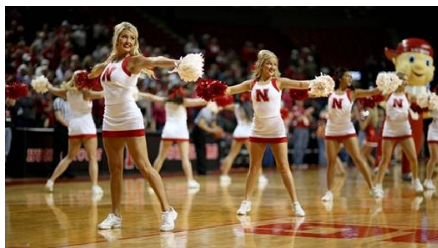
Nebraska University of Nebraska Lincoln