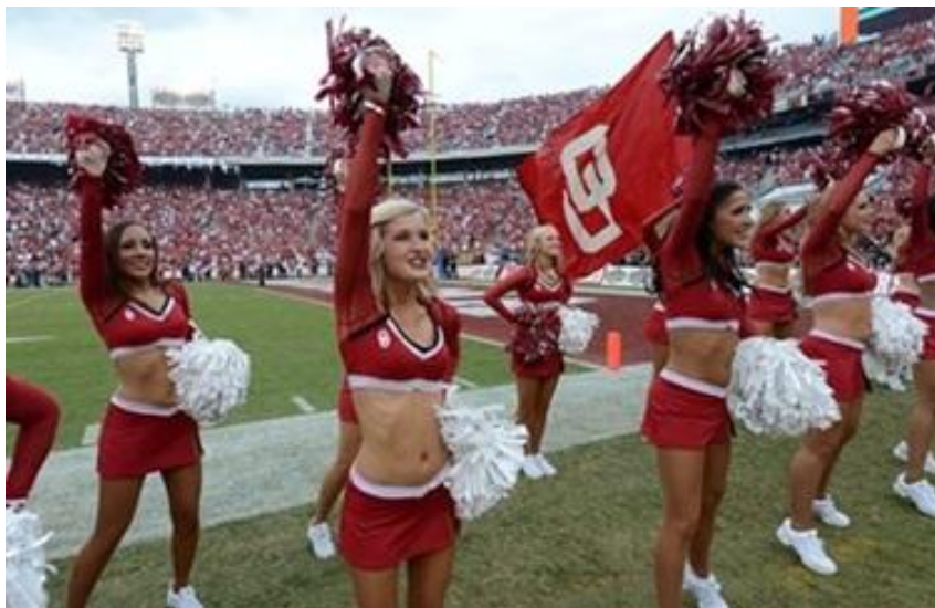
Ohio Ohio State University Columbus