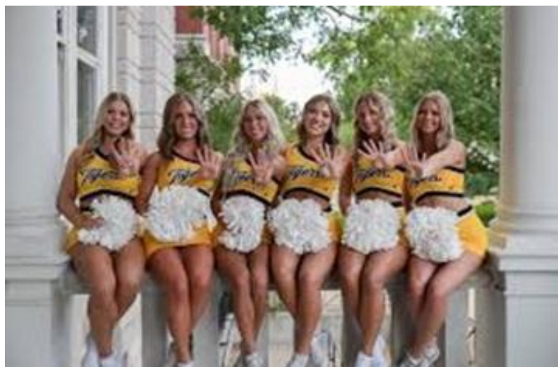
Missouri University of Missouri Columbia