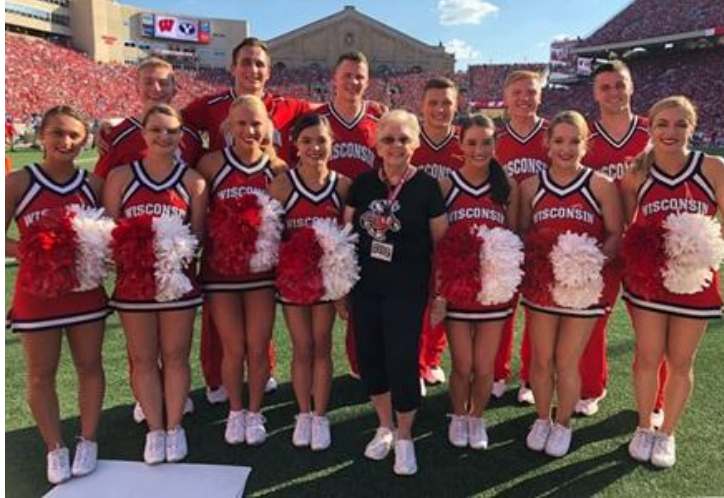
Wisconsin University of Wisconsin Madison