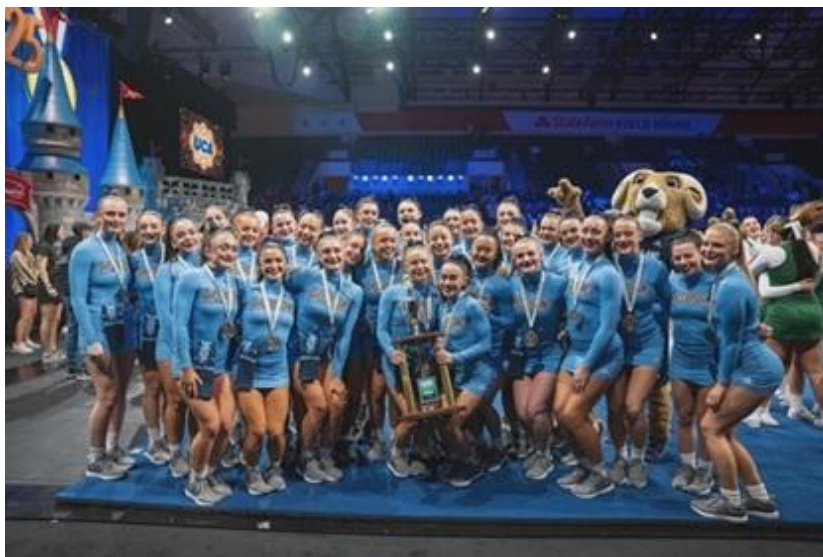
Rhode Island University of Rhode Island Kingstown