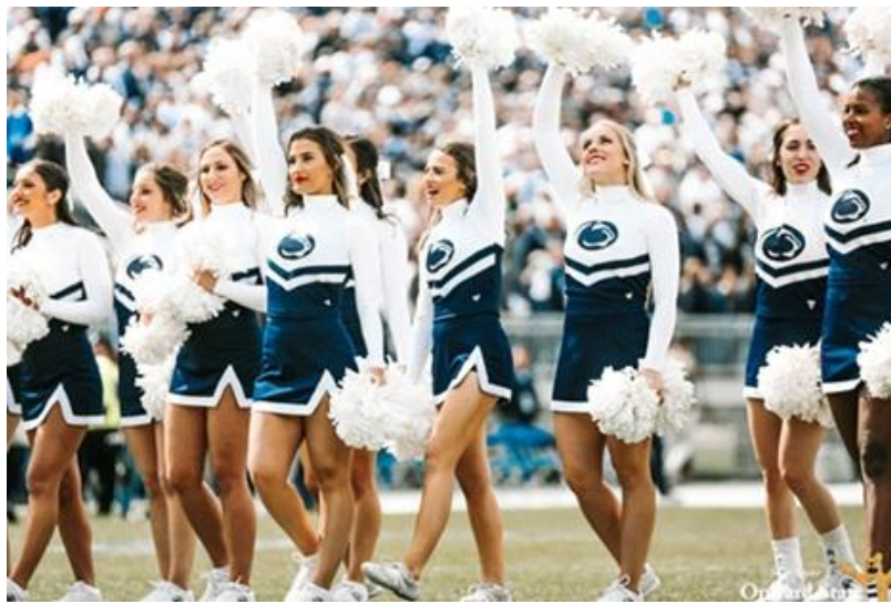
Pennsylvania Penn State University University Park