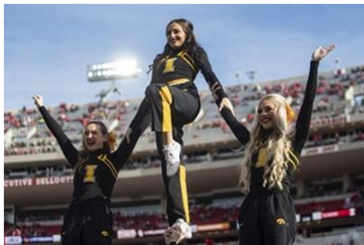
Iowa University of Iowa Iowa City