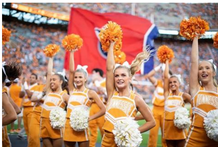
Tennessee University of Tennessee Knoxville