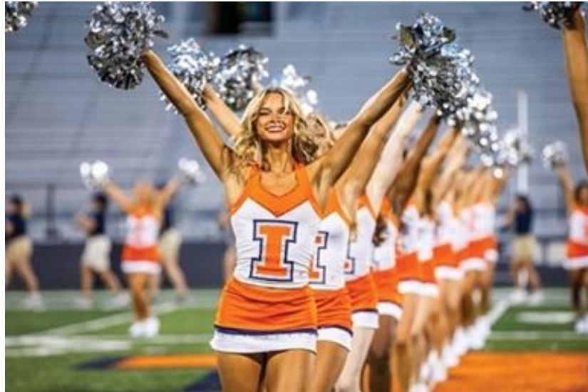
Illinois University of Illinois Champaign