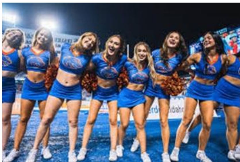
Hawaii University of Hawaii Honolulu