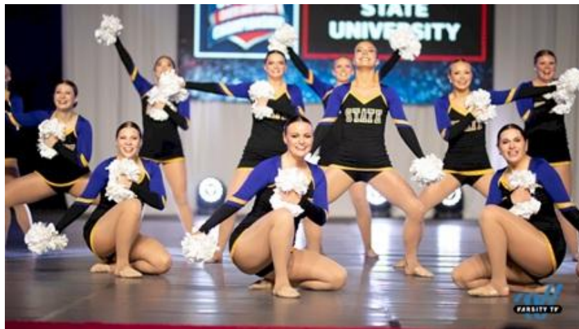
South Dakota South Dakota State University Brookings