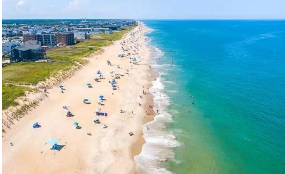
Outer Banks Beaches