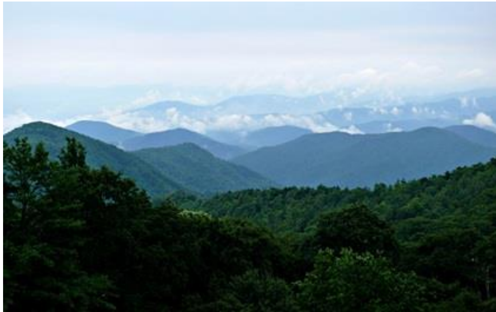
Blue Ridge Mountains

Part of the Appalachian Mountains, the Blue Ridge is known for being shrouded in a lovely bluish haze, especially when seen from a distance. This phenomenon is actually caused by trees. Oaks and other trees that thrive in the Blue Ridge release isoprene, a common hydrocarbon, to protect their leaves from heat stress and those emissions create the famous blue tint you see in these mountains.