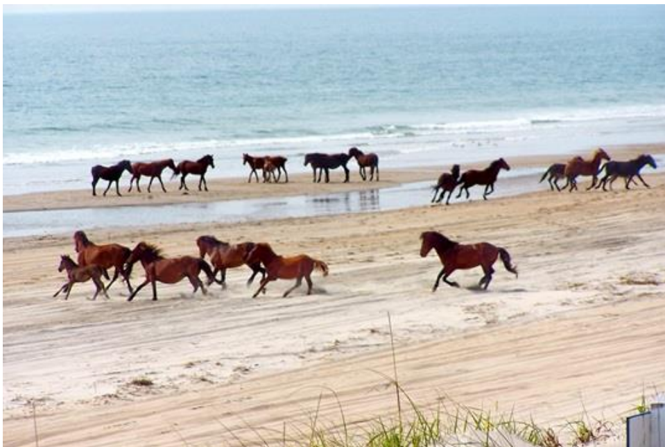
Outer Banks Wild Horses